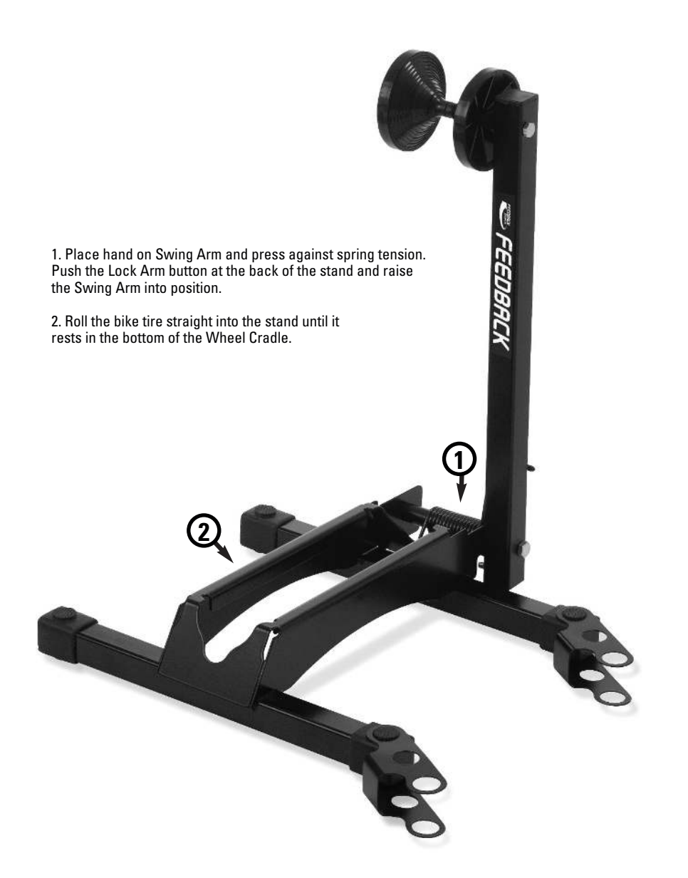
NOTE: Tire must be inflated to prevent bike from falling over.